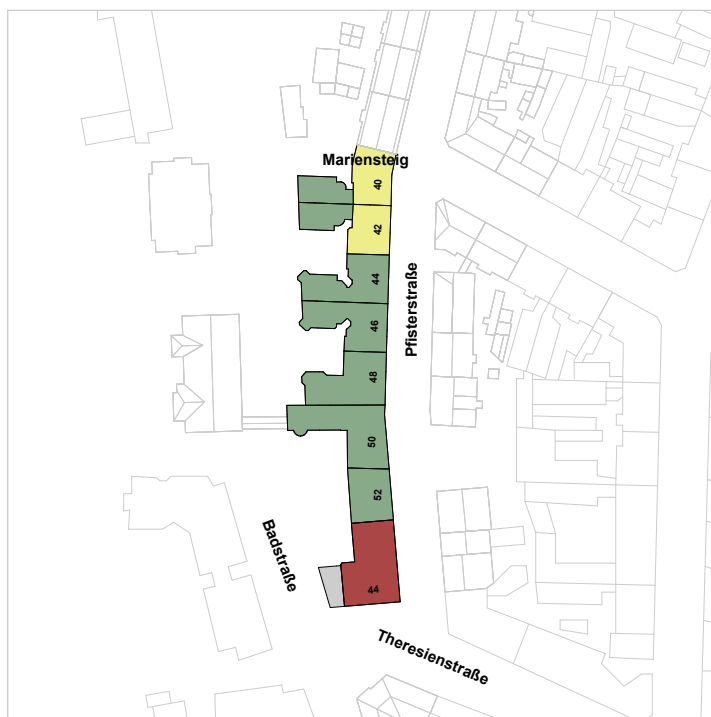
Block 4 - 1931 Fig. N4.2