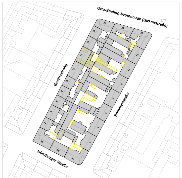
Block 2 - 2021